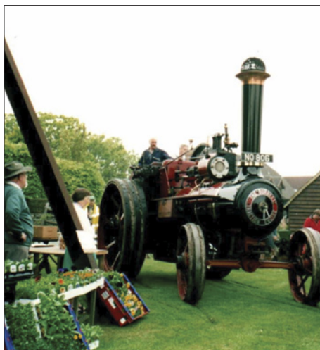
Steam engines on Mills Day 2001.