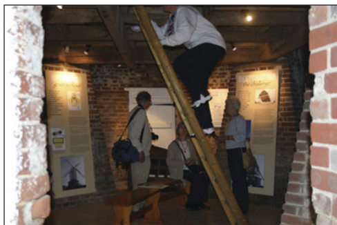
Left: The first guided tour.